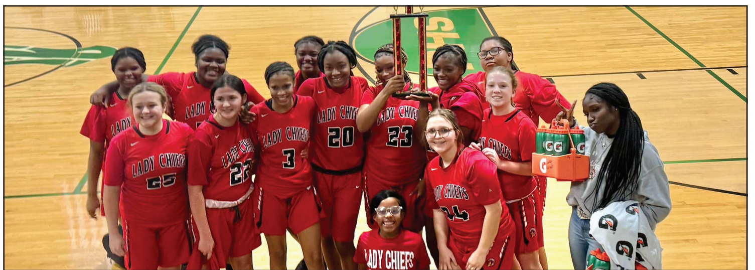
Special to Pelahatchie News

JH Lady Chiefs finish their season undefeated.