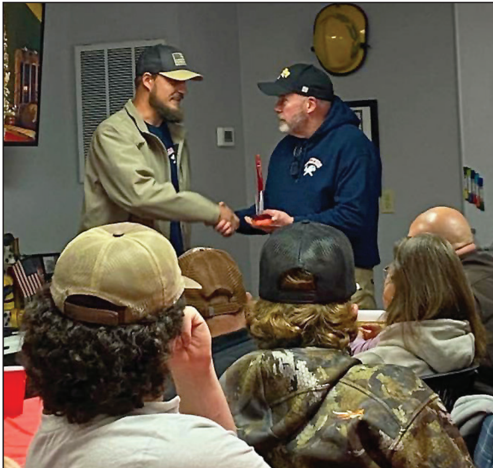
Special to Pelahatchie News