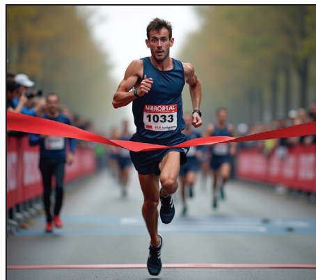
Special to Pelahatchie News

order to help facilitate personal growth and improve my health. At times, I hit those goals and I can feel really good about achieving success in certain areas of life. It always feels good to set a goal and achieve it. As a follower and disciple of Jesus, we can set certain practical goals that can help lead us toward spiritual growth, but the overall goal is always the same: to grow in Christlikeness. Paul wrote about this in his letter to the Philippian church. He wrote: "Not that I have already obtained this or am already perfect, but I press on to make it my own, because Christ Jesus has made me His own. Brothers, I do not consider that I have made it my own. But one thing I do: forgetting what lies behind and straining forward to what lies ahead. I press on toward the goal for the prize of the upward call of God in Christ Jesus." (Philippians 3:12-14) The 'this' Paul is referring to at the beginning of the quote is a righteousness that is only obtained through faith in Christ. (from Philippians 3:9) While the righteousness itself is actually God's own righteousness and is obtained by His people only by His grace given only through faith in Christ, it is