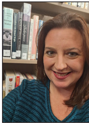
Special to Pelahatchie News

Happy New Year from the Pelahatchie Public Library. The Pelahatchie library is a part of the Central Mississippi Regional Library System (CMRLS), which consists of twenty branches located in Rankin, Scott, Smith, and Simpson counties. Your local library card grants you access to a wealth of books. If you would like to increase your reading in 2025, consider attempting the reading challenges suggested by NoveList. For example, read a horror novel in July to chill you while sunbathing by the beach. Brush up on your awareness of social issues in March, then seek a book