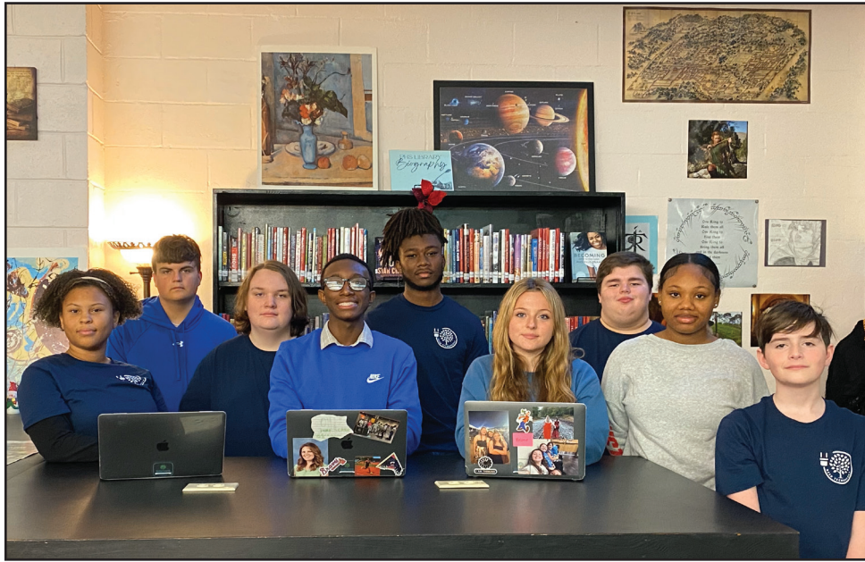
Special to Pelahatchie News