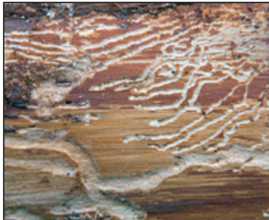
Special to Pelahatchie News

1) Salvage removal, many times the trees involved in the infestation can be