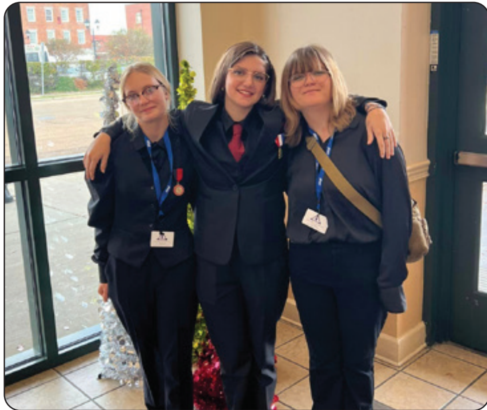
Special to Pelahatchie News