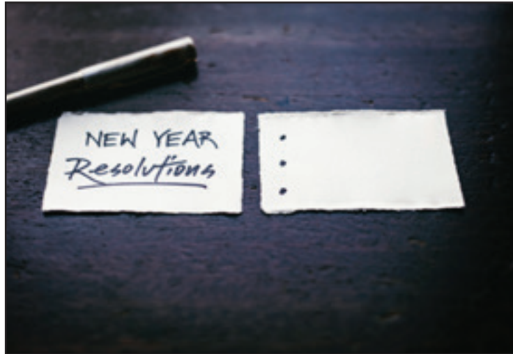
Special to Pelahatchie News

While so many of these kinds of goals or resolutions are related to physical health, and rightfully so, have you ever thought about setting goals or making resolutions that are spiritual in nature? We often look at our-