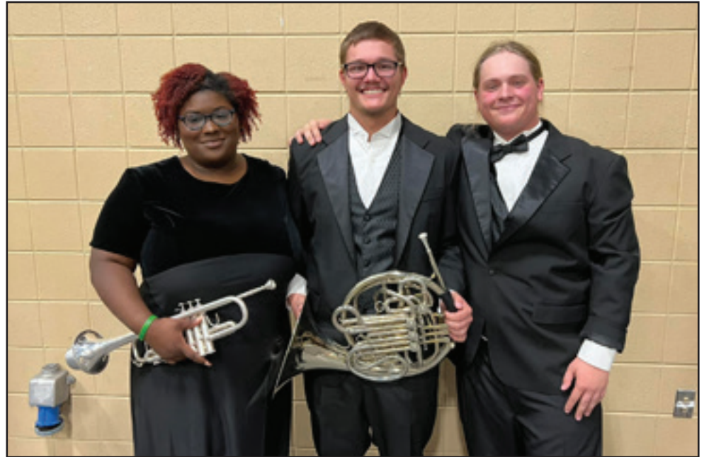
Special to Pelahatchie News