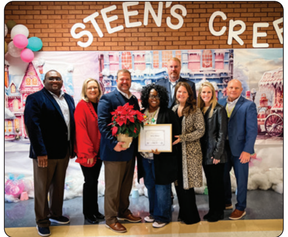
Special to Pelahatchie News