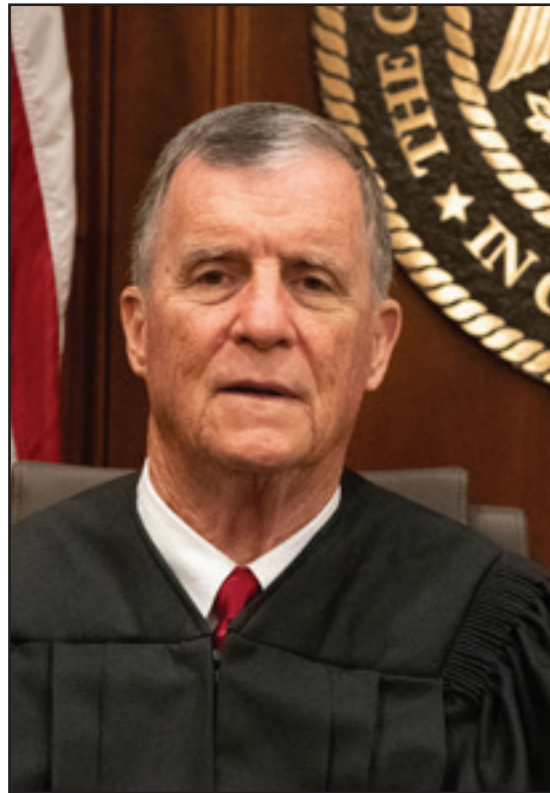
Special to Pelahatchie News

He served as First Assistant U.S. Attorney for the Southern District of Mississippi from 1989 to 1995. He returned